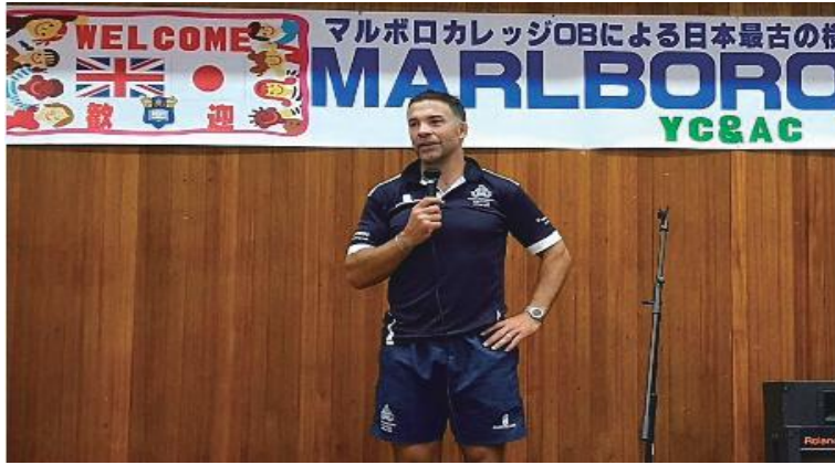
August 5 2016: Marlborough College coach