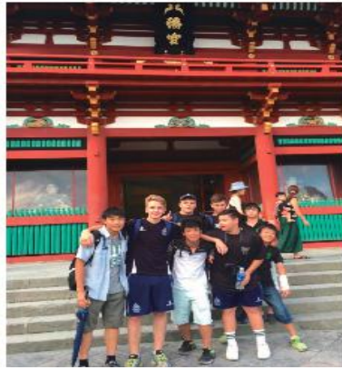
August 1 2016: Archery & visit to temple