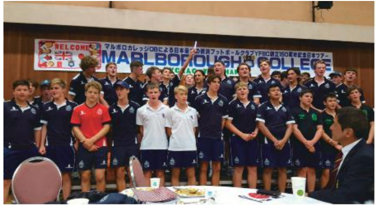
Marlborough boys sing Oasis song