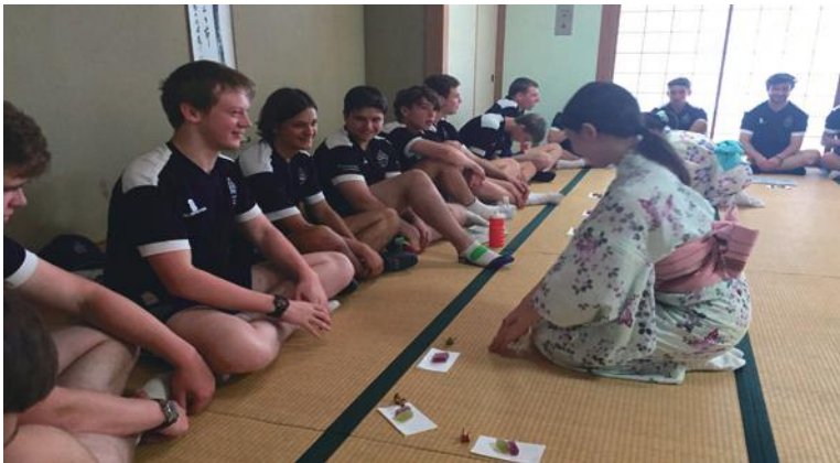
August 1 2016: Experiencing tea ceremony