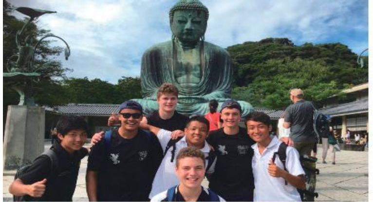
Visiting the Daibutsu in nearby Kamakura