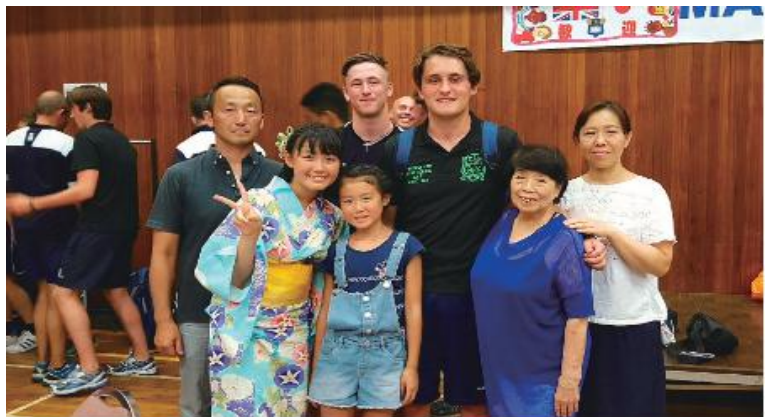
August 5 2016: Yokosuka dinner after match at YC&AC