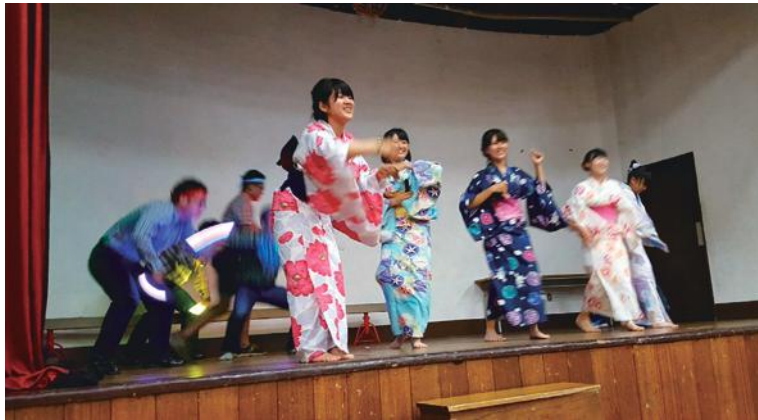
August 5 2016: Yokosuka HS rugby club managers lead dance performance & pose for photo