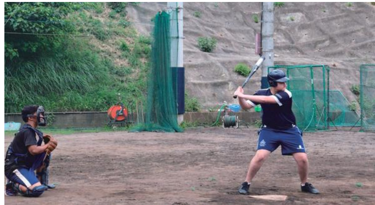
Marlborough boys experience baseball