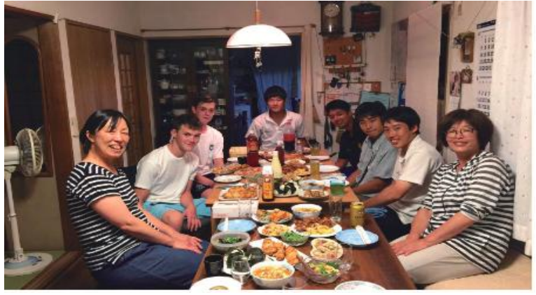
Evening meal with homestay family