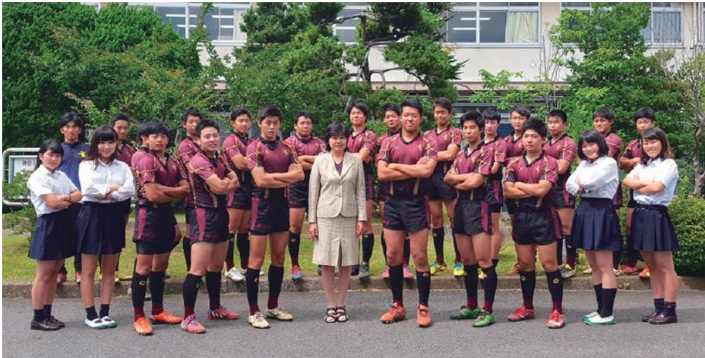
JYokosuka HS headmistress with members of school's rugby club

Japan-UK High School International Rugby can help make your school and its Japanese high school rugby players internationally minded and capable.