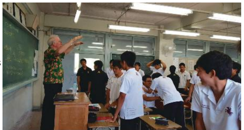
Homestay preparation English training

After the planning was completed, the first real event was a 2-hour homestay preparatory session & Q&A session attended by 35-40 pupils and 10-15 parents. Students were given a book on communication skills and expressions that can be used during home-stays. (called "Common Expressions for International High School Rugby Homestay Communication") and practised using some of them. Some parents had questions and these were answered.