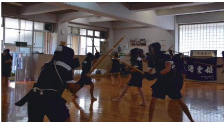
August 1 2016: Marlborough boys practice kendo