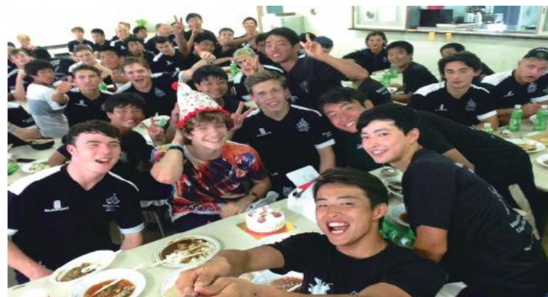
Marlborough boys enjoy Yokosuka HS lunch