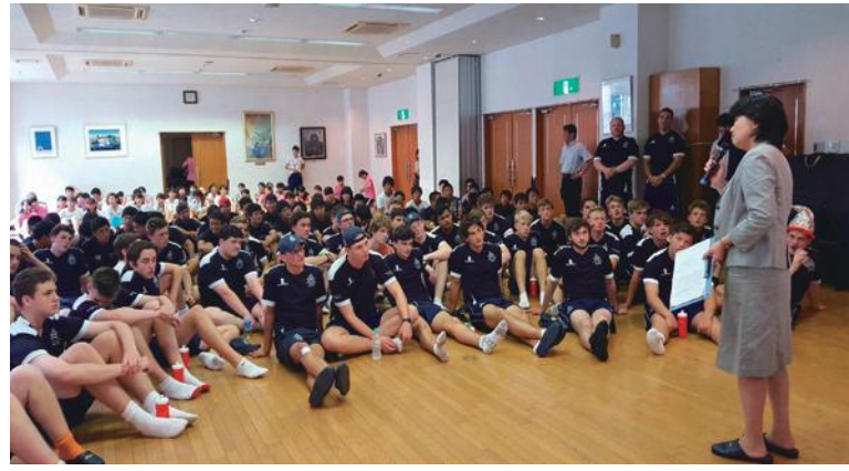
Headmistress' welcome speech