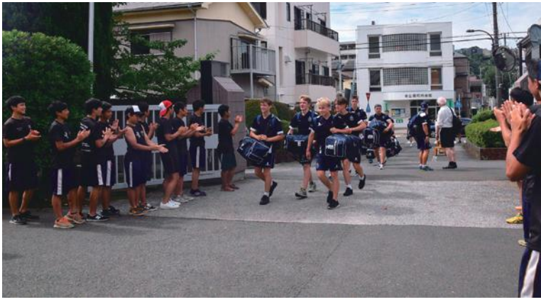
August 1 2016: Marlborough boys arrive at school