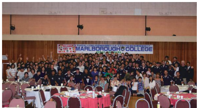
August 5 2016: Yokosuka HS after match function skit Final photo of reception participants (about 180!)