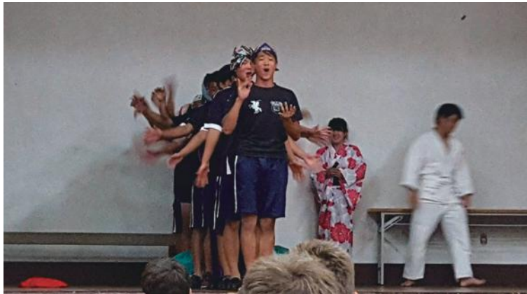
August 5 2016: Yokosuka HS after match function performances