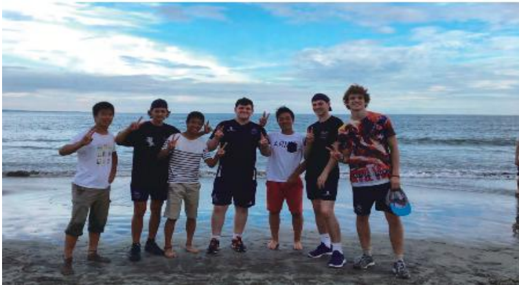
August 2 2016: Visit to a beach