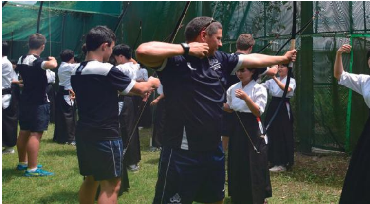
August 1 2016: Experiencing Japanese archery